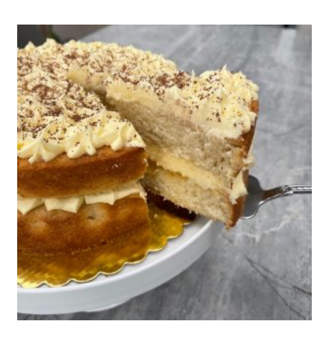
ENJOY! If you opt for The Ultimate Vegan Lemon Cake, please do share a picture!

3. Grate the vegan dark chocolate over the top and enjoy! Store in an airtight container.