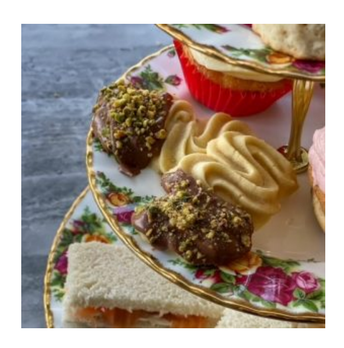
ENJOY! If you opt for Chocolate & Pistachio Viennese Whirls, please do share a picture!