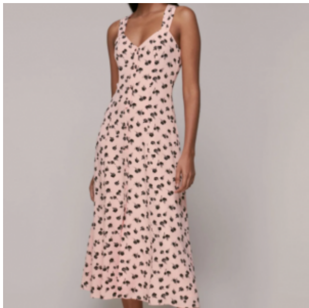
Whistles Scattered Carnation Midi Dress £149 – here