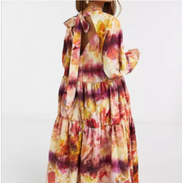
Damson Madder tiered organic cotton maxi dress in floral with bow neck tie £130 – here