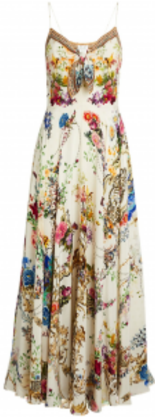
Camilla By the Meadow Maxi Dress £650 – here