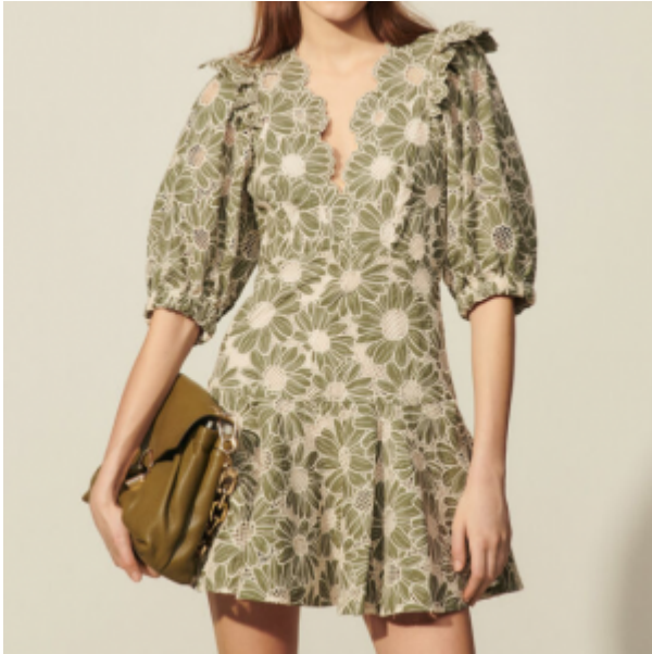
Sandro short embroidered dress £329 – here