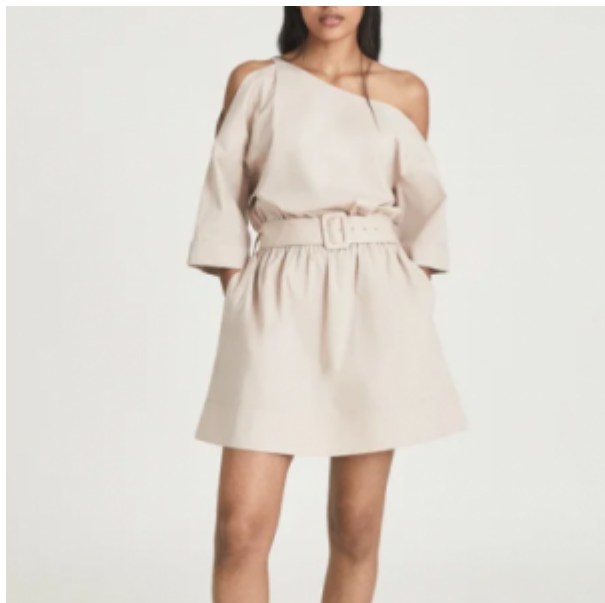
Reiss Demi one shoulder mini dress £188 – here