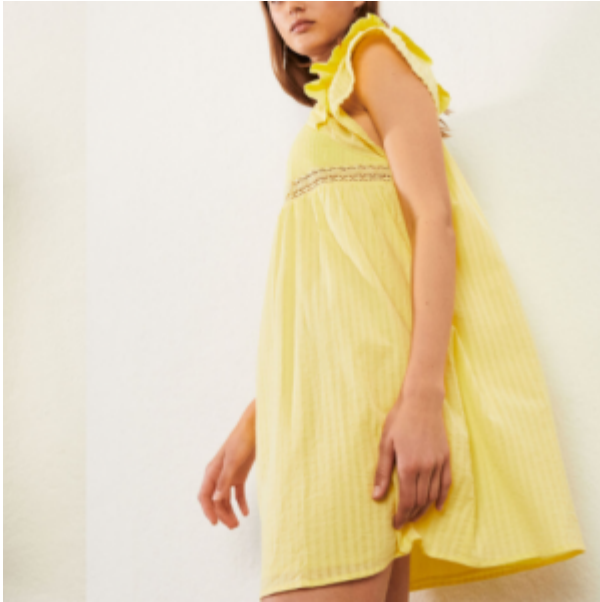
Ba&sh Uriel Short Dress £195 – here