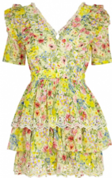
Loveshackfancy Aldina floral-print cotton-blend mini dress £405 – here