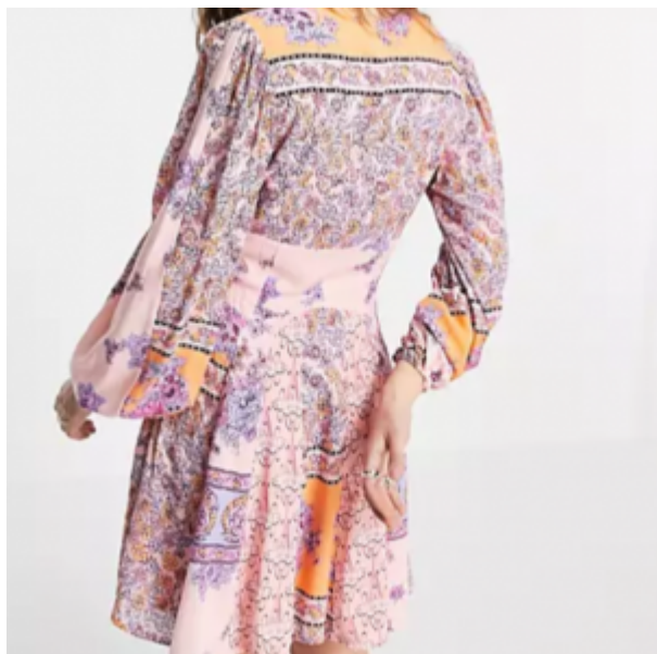
Free People tie front mini dress in pink paisley print £108 – here