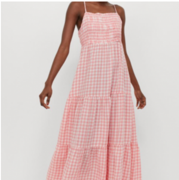
H&M Smocking-detail dress £39.99 – here