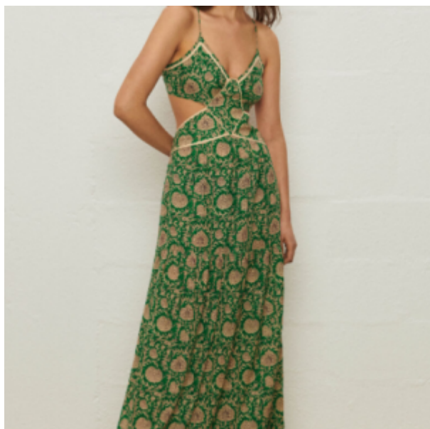
Ba&sh Paloma Maxi Dress £300 – here