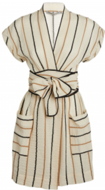
Three Graces Striped Aurora Wrap Dress £390 – here