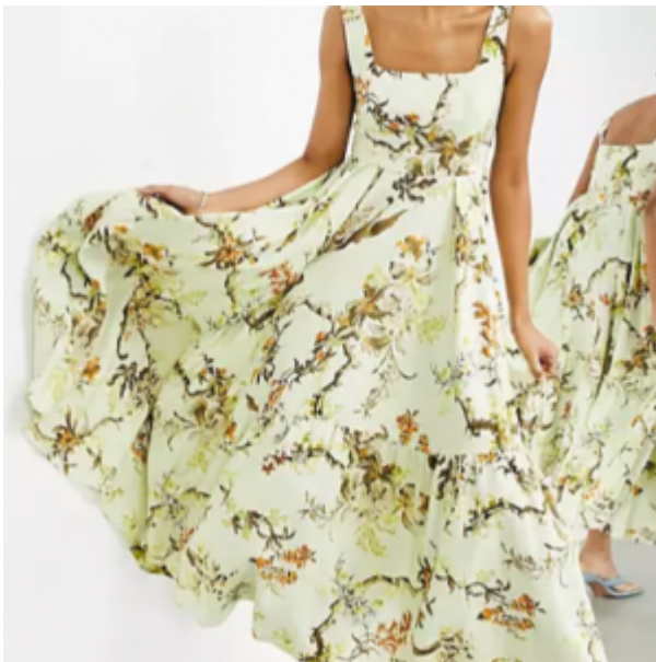
ASOS EDITION sleeveless square neck tiered midi dress in woodland print £110 – here