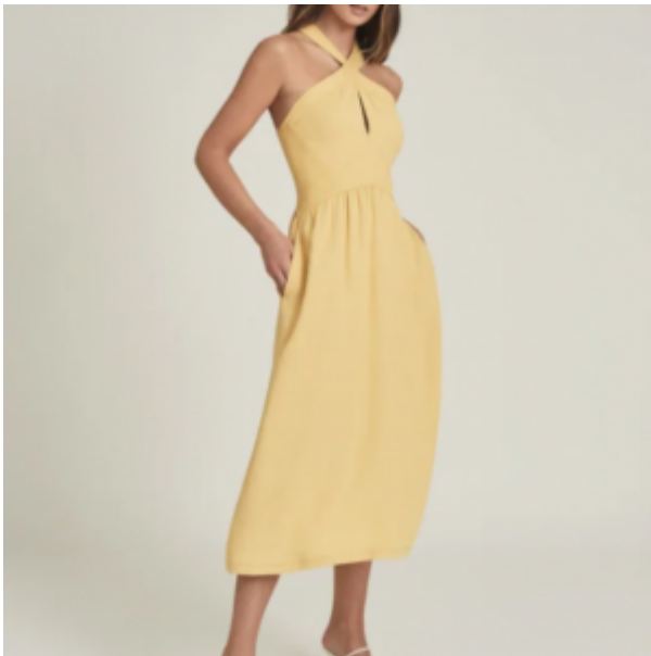
Reiss Orla Halter neck midi dress £185 – here