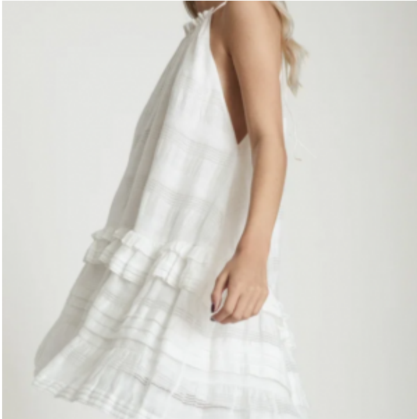
Reiss Gabriella Linen Blend Dress £195 – here