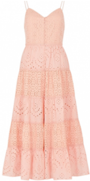
Alice & Olivia Shanti pink eyelet-embroidered cotton midi dress £450 – here