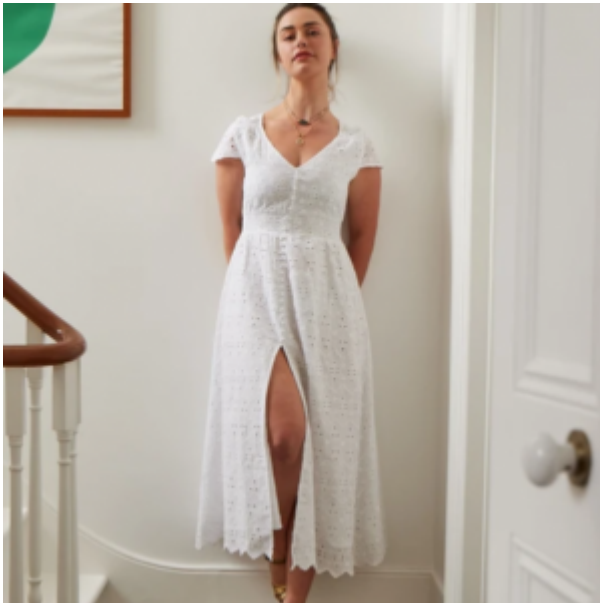
Marie & Lola Oriane Dress £79 – here