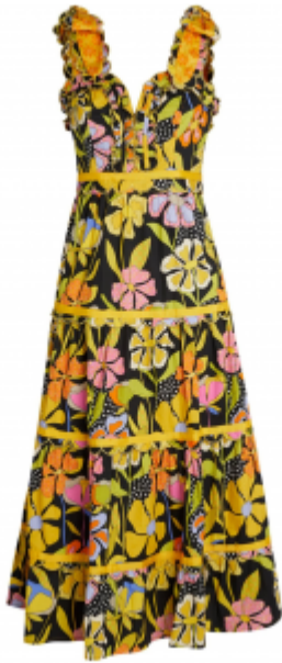
Celia B Midi Flora Dress £385 – here