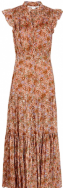
Veronica Beard Satori floral-print cotton maxi dress £490 – here