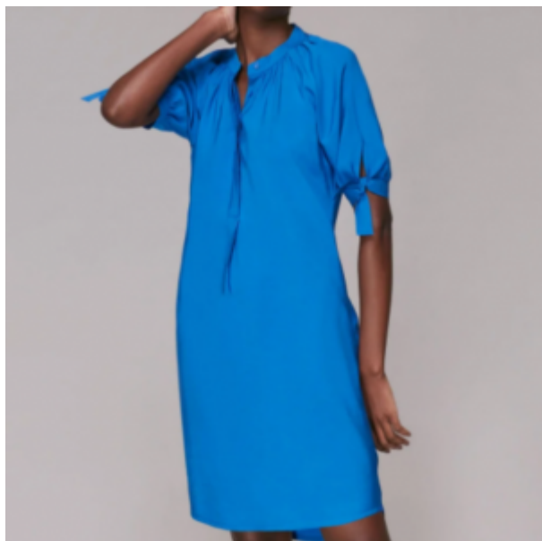
Whistles Celestine Dress £99 – here