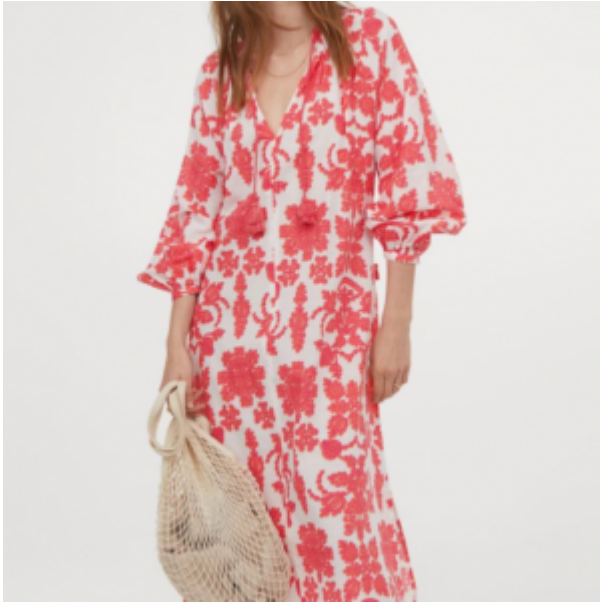
H&M Embroidered kaftan dress £39.99 – here