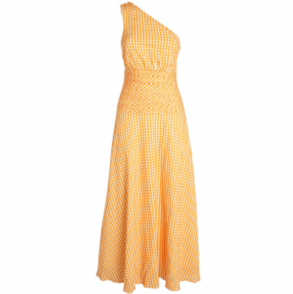
Peony Orange one shoulder gingham dress £335 – here