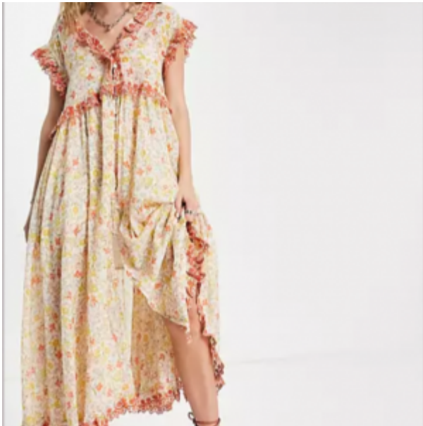
Free People milania midaxi dress with ruffle trims in vintage floral £158 – here