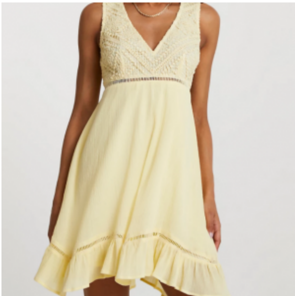
River Island Yellow 2 In 1 mini dress £50 – here