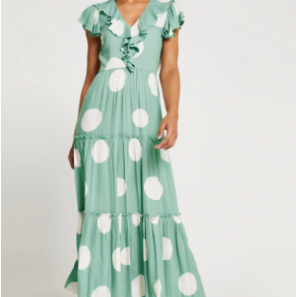
River Island, Turquoise short sleeve frill tier midi dress £42 – here