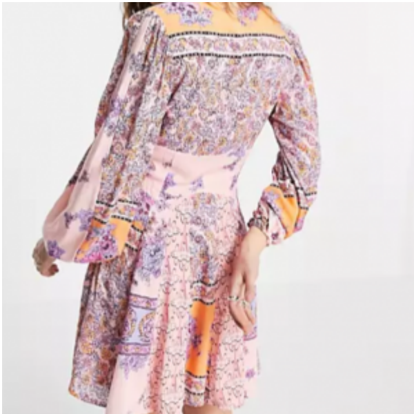
Free People tie front mini dress in pink paisley print £108 – here