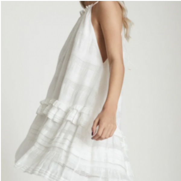
Reiss Gabriella Linen Blend Dress £195 – here