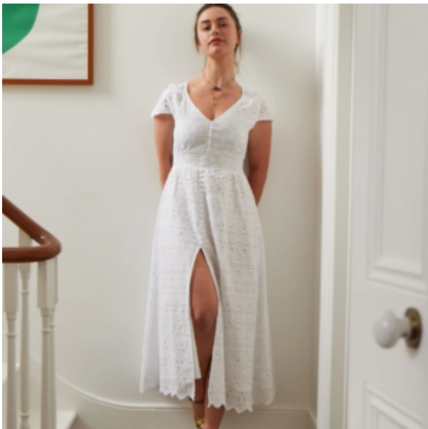
Marie & Lola Oriane Dress £79 – here