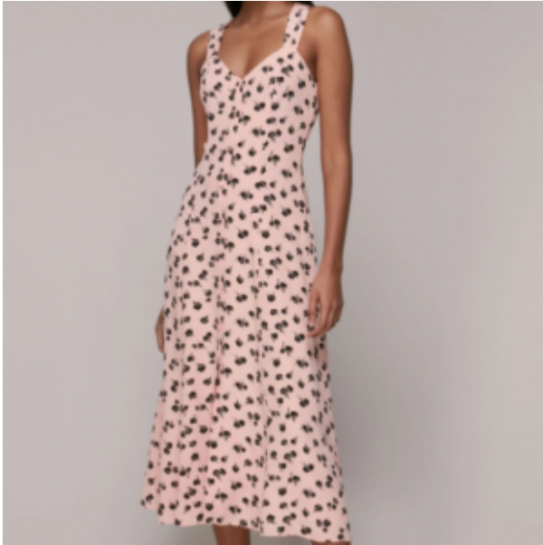
Whistles Scattered Carnation Midi Dress £149 – here