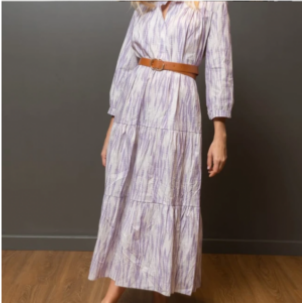
Marie & Lola Audrey maxi dress £69 – here