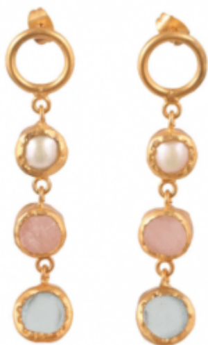
Interlink Mirror Dangle Earrings