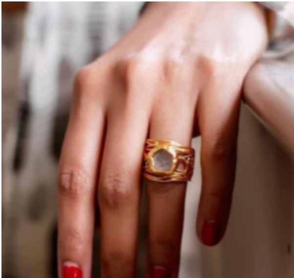
Rose Gold Shell Ring