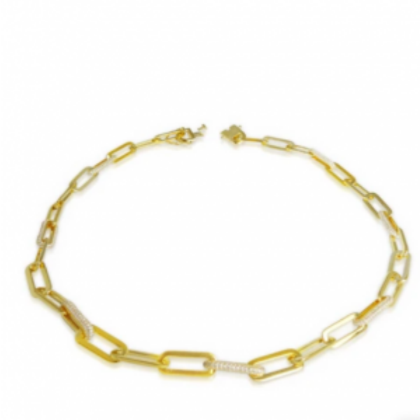
The Pink Mon Cœur Necklace