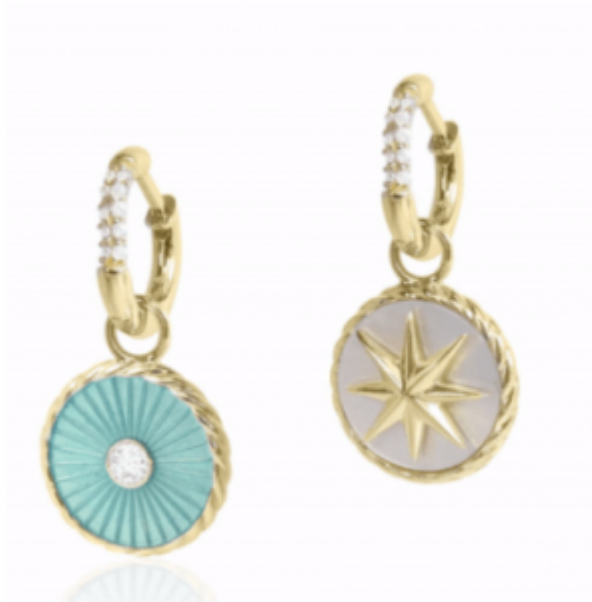
The New Romantics Gold Pearl Earrings