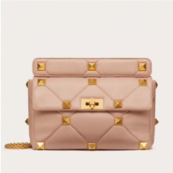
Large lambskin nappa Valentino Garavani Roman Stud The Shoulder Bag with chain – here