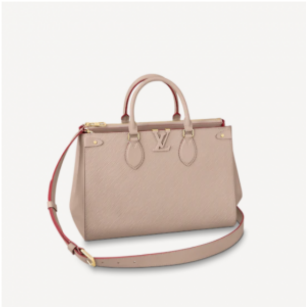
Grenelle MM Tote Bag – here