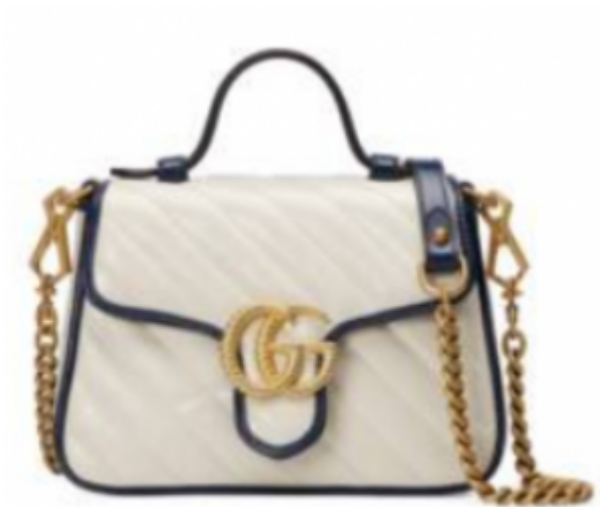
GG Marmont mini top handle bag – here