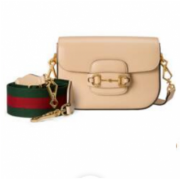
Gucci Horsebit 1955 mini bag – here