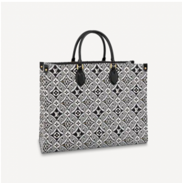
Since 1854 onthego gm tote bag – here