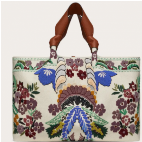
Valentino Garavani 02 Bow Edition Atelier canvas tote bag with multicolour thread, bead and sequin embroidery – here