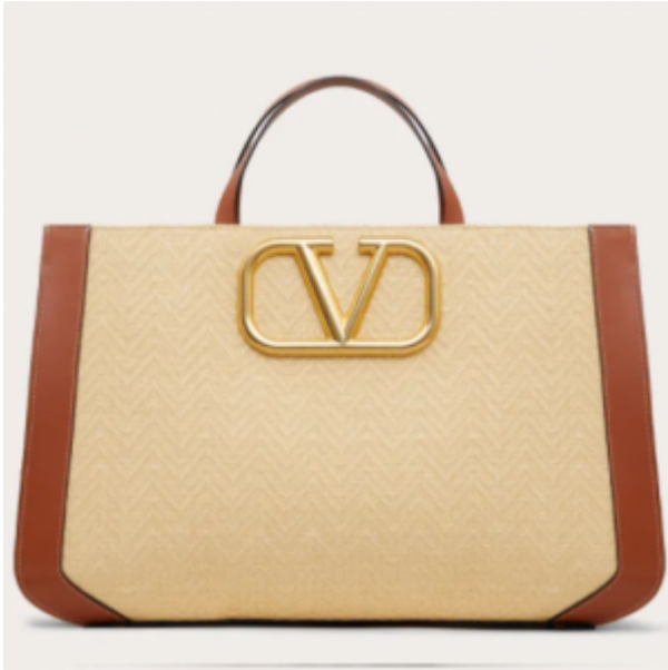
Valentino Garavani Supervee handbag in viscose raffia with chevron pattern featuring maxi VLogo Signature – here