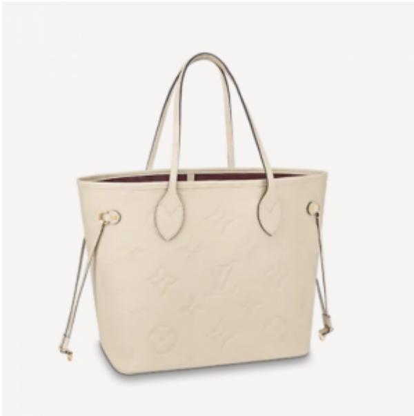
Never Full MM Tote Bag – here