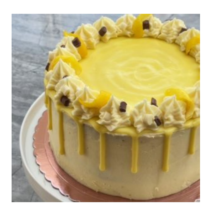
ENJOY! If you opt for Lemon & Chocolate Layer Cake, please do share a picture!