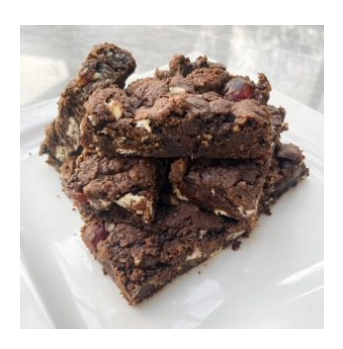
ENJOY! If you opt for Double Chocolate, Cherry and Oat Cookie Cake Bars, please do share a picture!