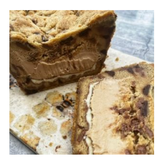
ENJOY! If you opt for Kinder Filled Cookie Loaf, please do share a picture!