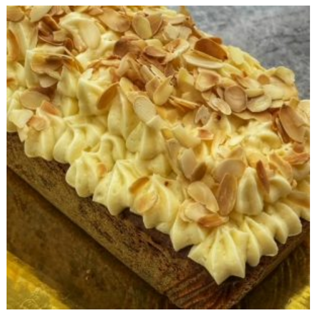
ENJOY! If you opt for Cherry, Almond & White Chocolate Loaf Cake, please do share a picture!