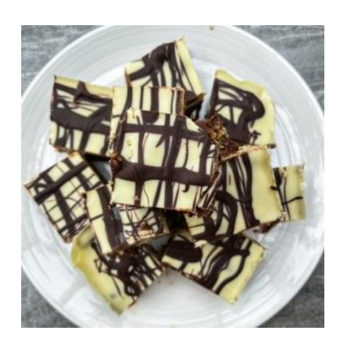
ENJOY! If you opt for White Chocolate and Malteser Tiffin, please do share a picture!