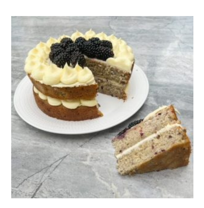
ENJOY! If you opt for Blackberry & White Chocolate Cake, please do share a picture!