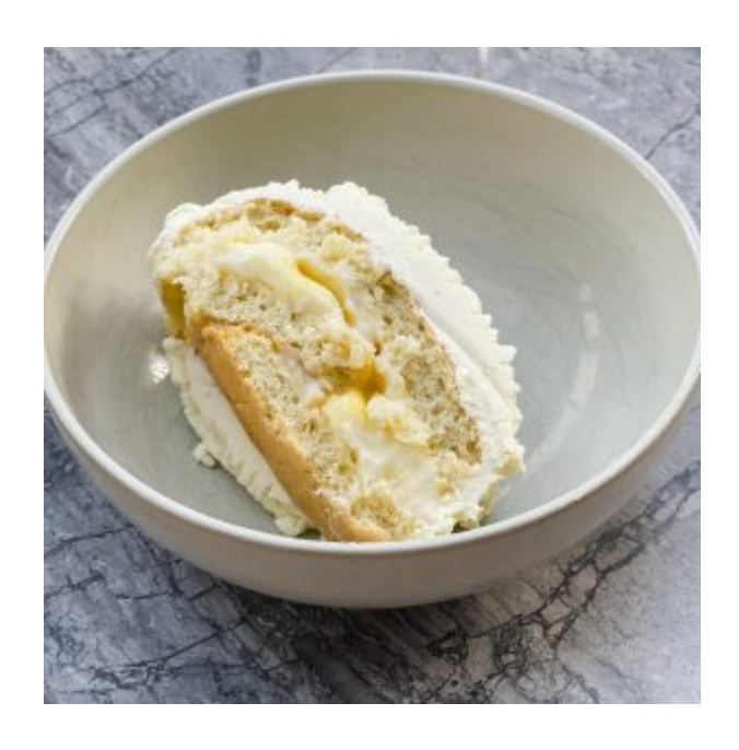
ENJOY! If you opt for lemon & white chocolate Yule log, please do share a picture!