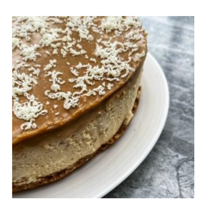
ENJOY! If you opt for Chocolate & Peanut Butter No Bake Cheesecake, please do share a picture!