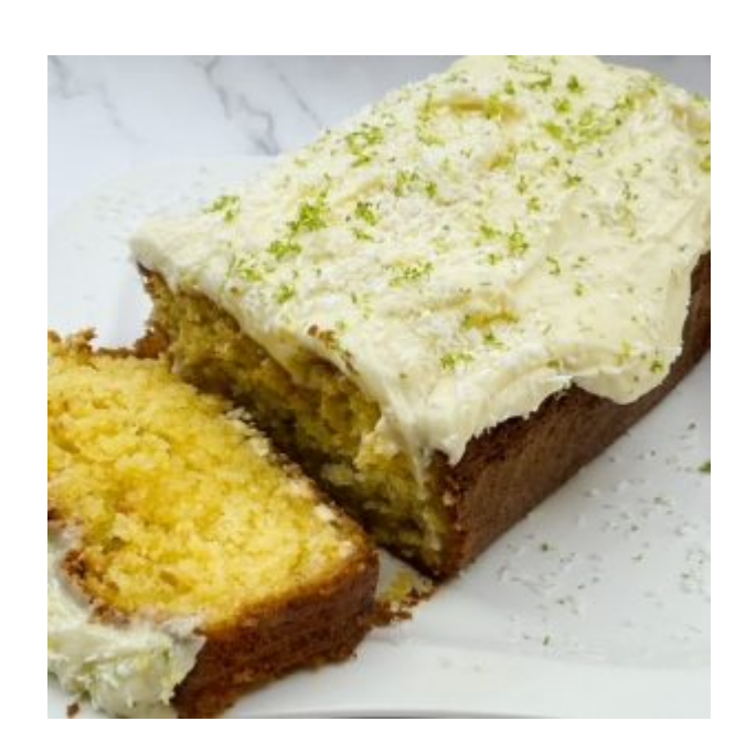
ENJOY! If you opt for Coconut, Lime & White Chocolate Loaf cake, please do share a picture!