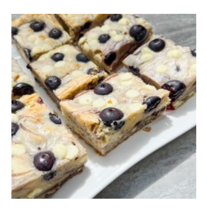
ENJOY! If you opt for White Chocolate and Blueberry GF Blondies, please do share a picture!