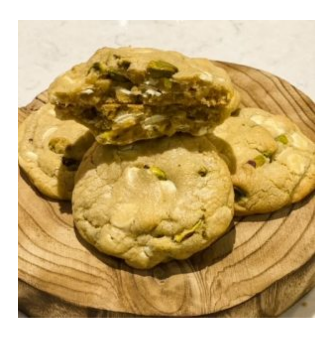
ENJOY! If you opt for Pistachio & White Chocolate Cookies, please do share a picture!