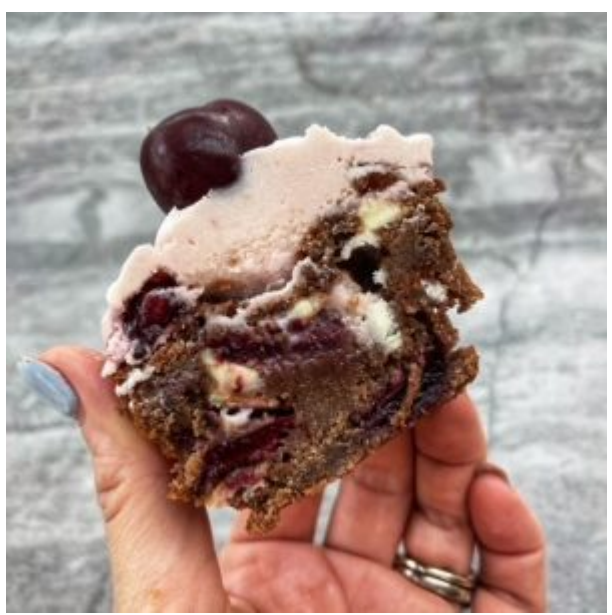
ENJOY! If you opt for Chocolate & Cherry Cupcakes, please do share a picture!